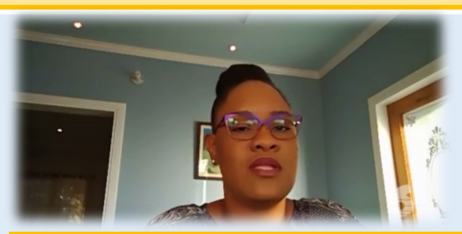
Photo (above): The Honourable Ayanna Webster-Roy , Minister of State in the Office of the Prime Minister commence the observance of Child Abuse Prevention Month with a virtual interview on TV 6.

This month communities are encouraged to share child abuse prevention strategies and promote prevention across the country.